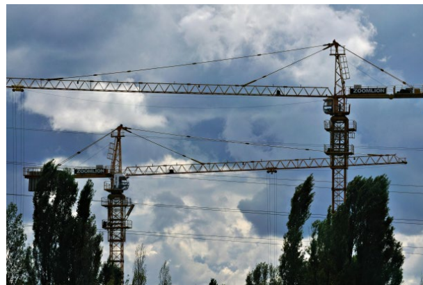
Figure 3: Cranes are especially vulnerable to lightning.

Employers should also post information about lightning safety at outdoor worksites. All employees should be trained on how to follow the EAP, including the lightning safety procedures.